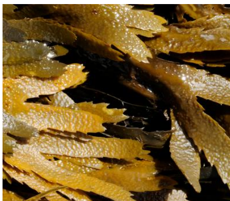
Figure 1. Brown algae “ Fucus serratus ”

The brown algae ( Phaeophyta ) are particularly efficient accumulators of metals due to high levels of sulfated polysaccharides and alginates within their cell walls for which metals show a strong affinity [10]. Nielsen et al. [37] suggested that brown algae such as Fucus spp. often dominate the vegetation of heavy metal-contaminated habitats (Figure 1).